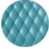
NCS S4020-B10G Dusty blue ≡