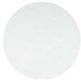
NCS s0502-b VR Traffic white ☀