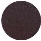
VR Rough metallic bronze ☀