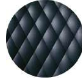
NCS S7502-B Anthracite grey ≡