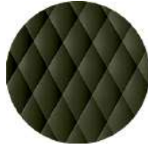
NCS S7020-G50Y Olive green ☀