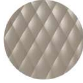
NCS S4005-Y50R Turtle-dove ≡