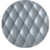
NCS S4005-B20G Squirrel grey ≡