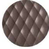
NCS S6502-R Clay ≡