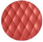
NCS S3060-Y80R Coral red ≡