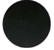
NCS S9000-N VR Matt Jet Black ☀