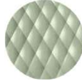
NCS S3010-G50Y Pistachio ≡