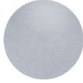
NCS S4000-N VR White aluminium ☀