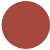
NCS S4040-R Marsala ☀