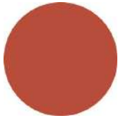
NCS S3060-Y80R Coral red ☀