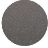
VR Pewter ☀