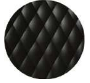
RAL 9005 Jet black ≡