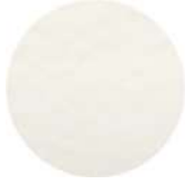
NCS S0500-N VR Pure white ☀