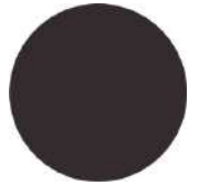
NCS S8005-Y20R Brown ☀