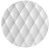
NCS S0502-B Traffic white ≡